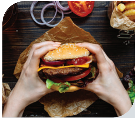
Identifying lifestyle risk factors to provide affordable and sustainable options to prevent and treat chronic diseases that are the leading causes of worldwide mortality.