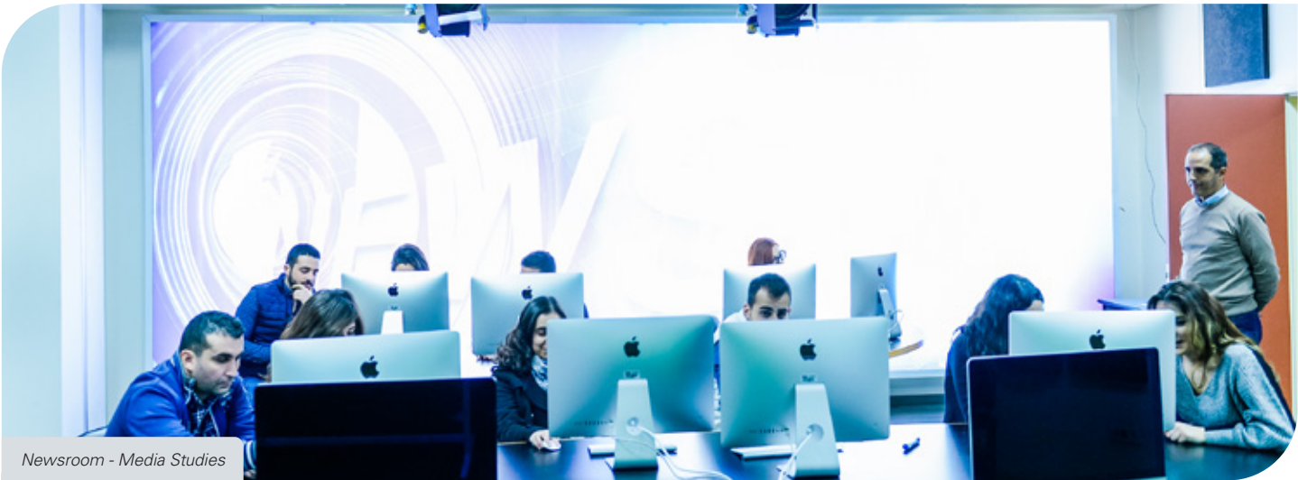
Newsroom - Media Studies