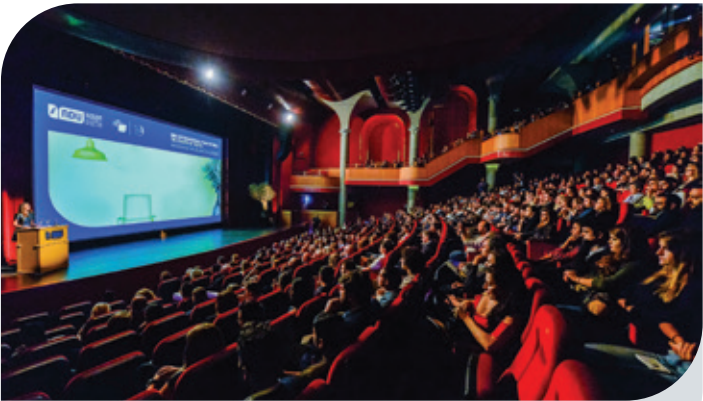
NDU International Film Festival – Involving NDU Division of Audiovisual Arts Students.

The NDU International Film Festival (NDUIFF) was founded in 2007 and is celebrated annually under its constant theme: “The Power of Youth”. The NDUIFF includes both Lebanese and international short films; winners receive awards, certificates, and cash prizes. More than 5,000 visitors attend the NDUIFF every year, including more than 50 international guests from more than 40 countries worldwide.