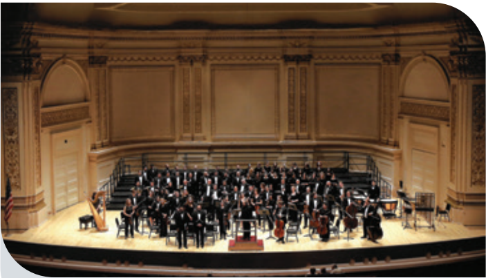
NDU Choir performing at Carnegie Hall in New York City in 2010.