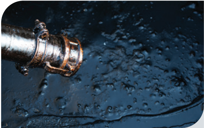
Optimizing multi-functional heat exchangers/reactors used to refine crude petroleum.

Human technological and industrial advances have been paralleled with major changes to the environment, some significantly detrimental. Research at NDU is aimed at identifying solutions, both technological and societal, to these problems. For example,