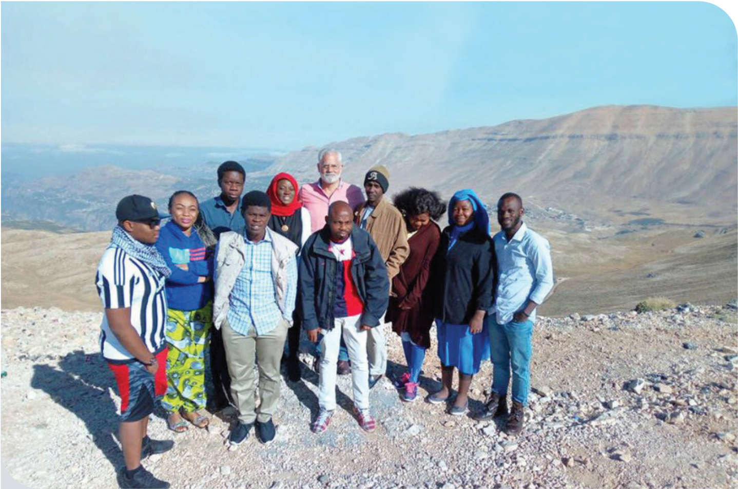
A group of ten professionals from different fields taking part in the “Study Abroad in Lebanon” (SAIL) program in 2018, an ongoing collaborative effort between the Cedars Institute in Lebanon and the Wole Soyinka Foundation (WSF) in Nigeria.

The Benedict XVI Endowed Chair of Religious, Cultural, and Philosophical Studies continues its outreach to the world by bringing students, staff, faculty members, and community members from abroad to Lebanon through its yearly “Study Abroad in Lebanon” (SAIL) Program, a course on “World History Through the Eyes of Lebanon.” This inter-cultural, inter-religious, and on-site approach to the teaching of world history emphasizes the unity of the human race and encourages participants to be responsible for the cultivation of this unity.