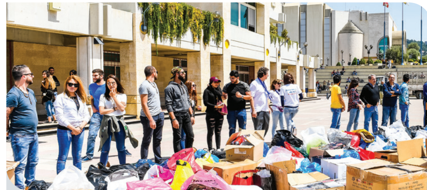
The Department of Community Service and Awareness at NDU collaborating with Nusroto Association to launch the “Unchain my Heart” initiative in 2017 that involves students in aiding communities.

The Department of Community Service and Awareness in the Office of Student Affairs organizes and provides opportunities for students to contribute to the wellbeing of society.