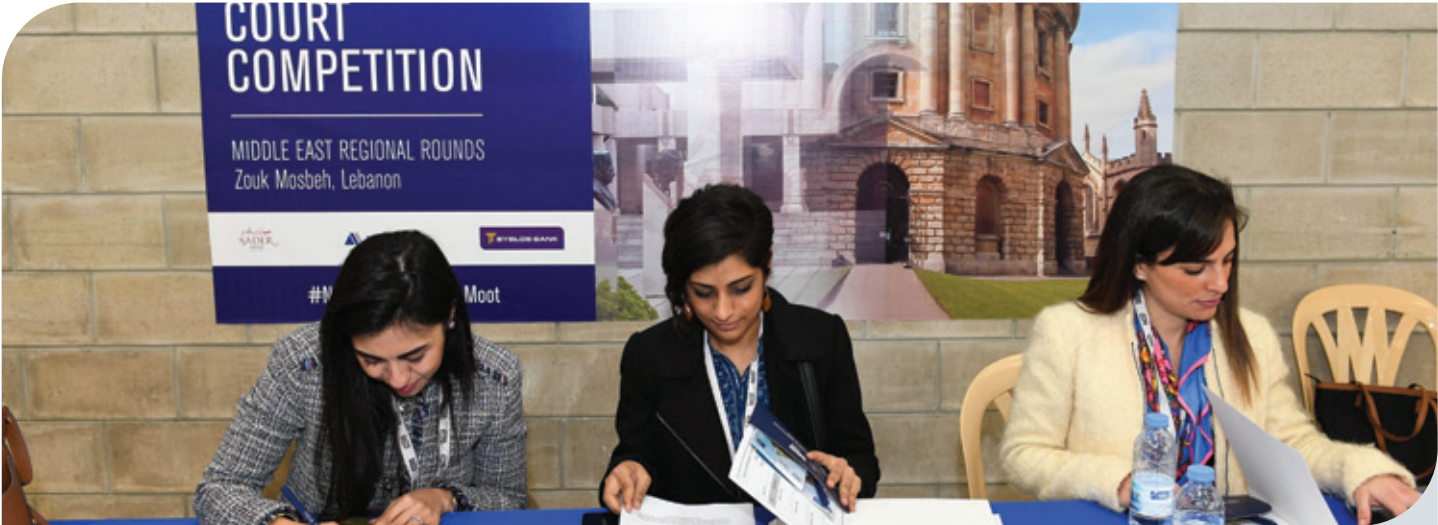
The “Price Media Law Moot Court Competition,” hosted by the Faculty of Law and Political Science at NDU in 2018. Students from universities around the Middle East and North Africa participated in this annual high-profile event.