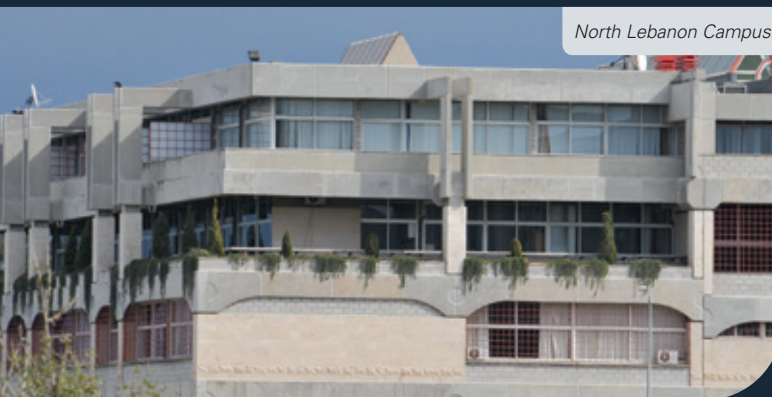
North Lebanon Campus