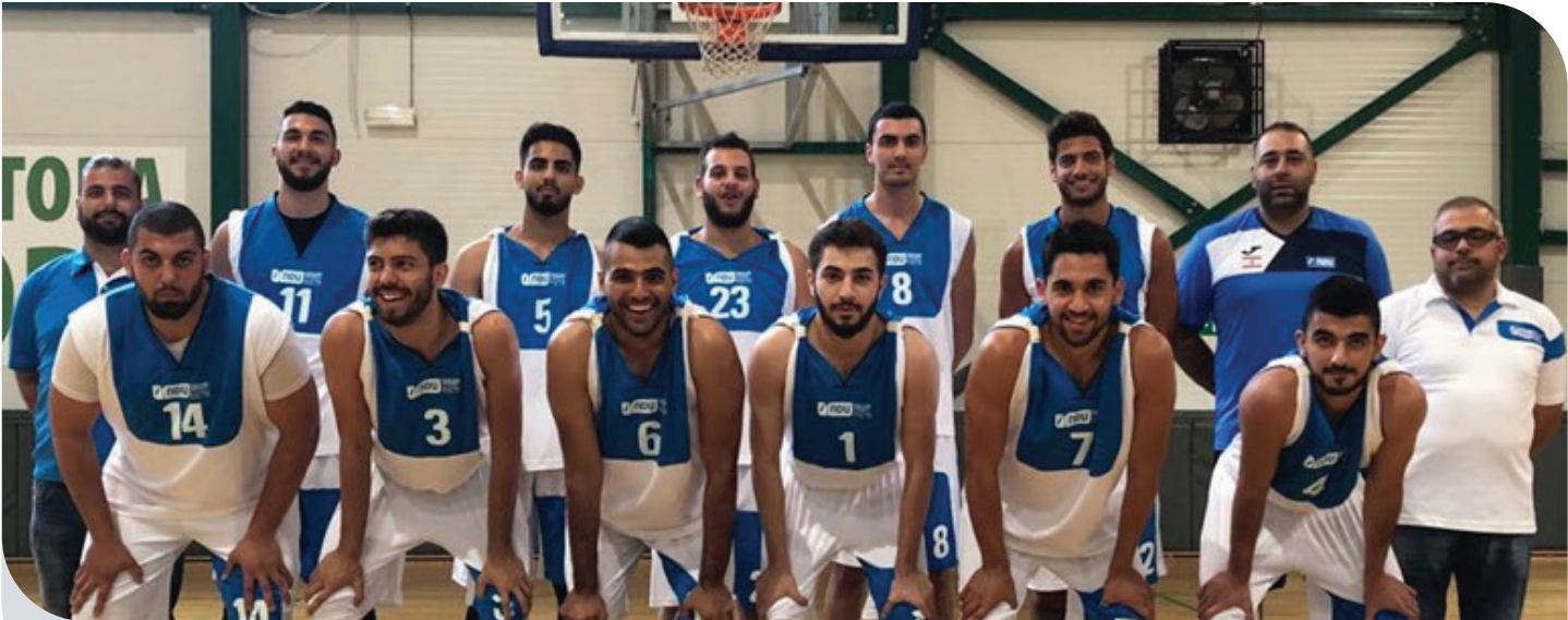
Basketball: The NDU men's basketball team competing in the Belgrade Sport Tournament 2018 (BEST) in Serbia.