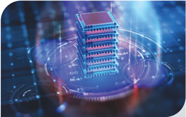
Designing new architectures for adaptive cybersecurity.

The increase in the world's population, coupled with the rapid environmental changes, have created novel health challenges. Research at NDU is aimed at defining the evolving health risks and at designing sustainable solutions and potential treatments. For example,