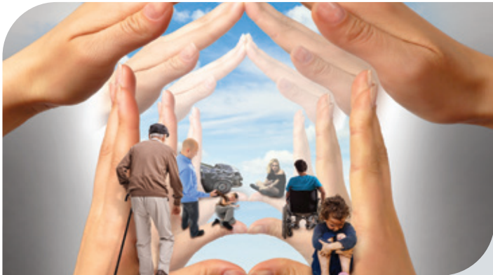
NGO Social Fair

Established in the year 2000, this annual fair is a collaboration between The Department of Community Service and Awareness, a subset of the Office of Student Affairs, and the NDU Human Rights Club, a student initiative. This fair showcases volunteer activities of NDU students whose goal is to help build a better society.