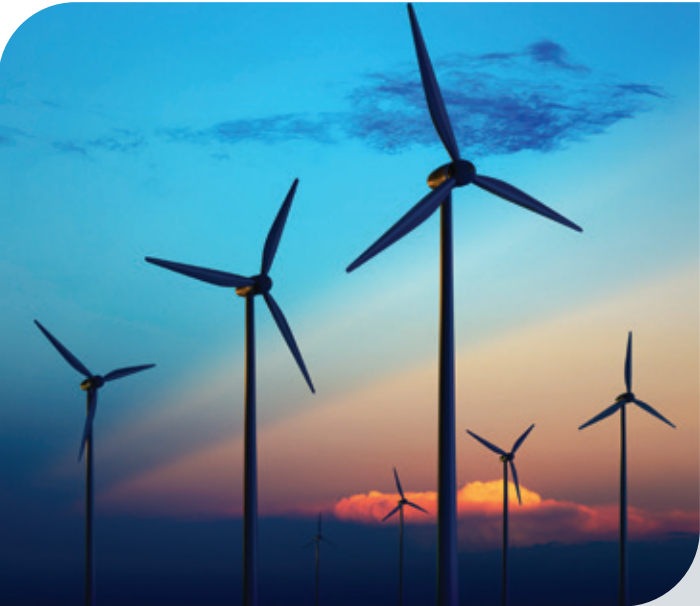
Designing the next generation of wind turbine blades that correct their shape passively through coupling bending and torsion.

Electricity production has traditionally relied on the burning of fossil fuels or on nuclear fission, both of which create byproducts that are harmful to the environment and public health. Research at NDU is aimed at designing environmentally friendly sources of energy. For example,