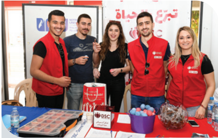
One of the NDU student-led humanitarian activities at the 2018 Annual NGO Fair.

NDU focuses on scholarship that is rooted in helping local, regional, and international. NDU research activities drive technological, cultural, societal, and artistic innovation. The research and innovation span broad fields and disciplines, including waste management, water resource management, health sciences, machine learning, big data analysis, plastics recycling, alternative sources of energy, petroleum industrial processes, cultural preservation, and cultural dialogue. These efforts have resulted in more than 180 papers published in refereed international journals over the last two years and numerous conferences and events hosted by NDU faculty members.