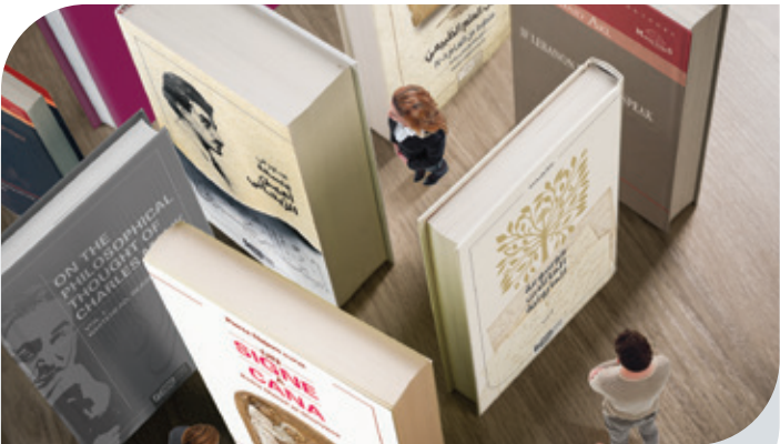
Various NDU publications.

The Office of NDU Publications pursues its mission by publishing/disseminating information to the scholarly and higher education communities, thus fostering the exchange of ideas and expertise with other similar communities, both locally and overseas.