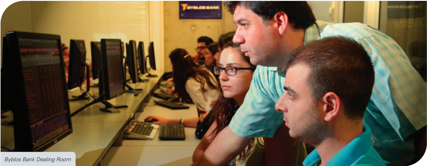
Byblos Bank Dealing Room