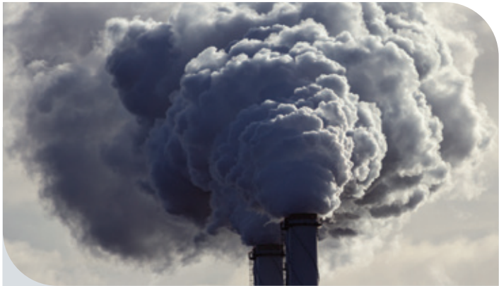
Designing accurate methods to identify, and reduce the amounts of, toxic components of air pollution.

The world is speeding towards a digital environment that has exciting potential, from virtual reality to artificial intelligence. This potential is accompanied by challenges to be surmounted and dangers to be avoided or tackled. Research at NDU is aimed at innovating, and taking part in defining, this new and unexplored paradigm. For example,