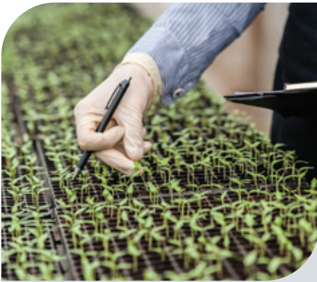
Identifying the major sources of environmental and agricultural contaminants in today's nutrition.

The increase in the world's population, coupled with the rapid environmental changes, have created novel health challenges. Research at NDU is aimed at defining the evolving health risks and at designing sustainable solutions and potential treatments. For example,