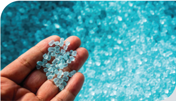
Developing simpler and more efficient recycling methods that produce high added-value products for all types of plastics.

Human technological and industrial advances have been paralleled with major changes to the environment, some significantly detrimental. Research at NDU is aimed at identifying solutions, both technological and societal, to these problems. For example,