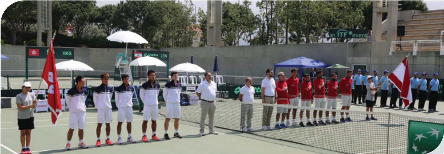
Davis Cup tennis match in 2018, by BNP Paribas, between Lebanon and Hong Kong taking place at NDU. The Lebanese team included NDU students.

Many students at NDU are members of NDU sports teams that have won awards in competitions among Lebanese universities, the Unileague, or the Lebanese Federation of University Sport.