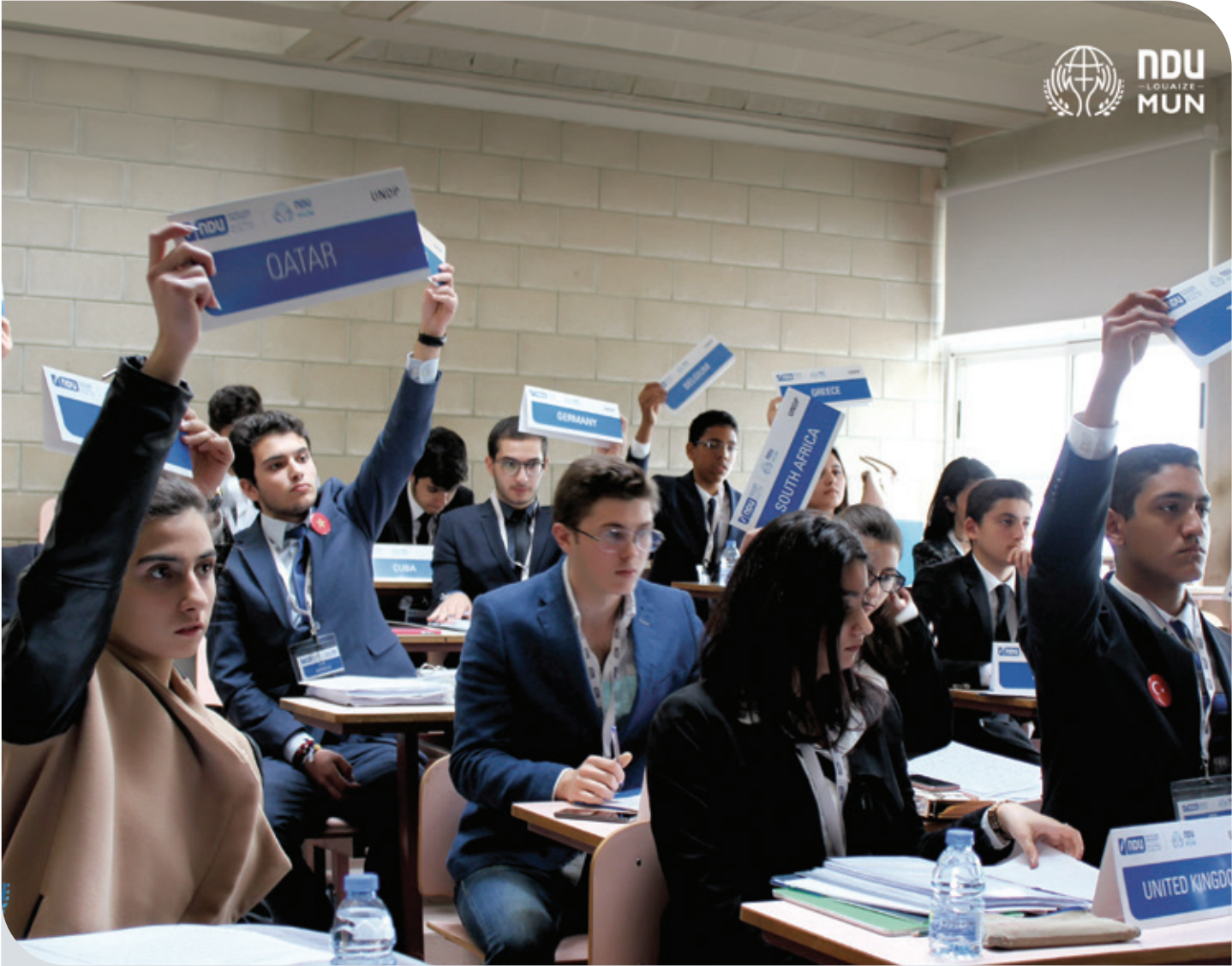
The “2nd NDU MUN” conference held in 2018 at NDU; more than 250 students attended from 22 schools across Lebanon.

Model United Nations (MUN), a replica of the United Nations managed by students in an academic setting, permits students to debate issues at the forefront of international relations. MUN has organized many national and international activities whose goal is to encourage dialogue and promote awareness.