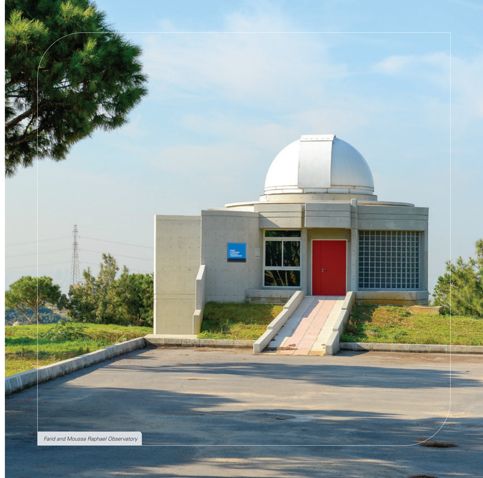
Farid and Moussa Raphael Observatory