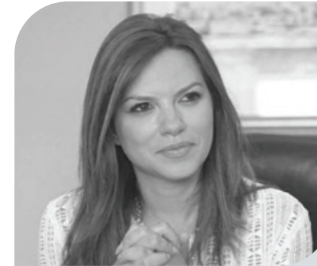
H.E. Violette Khairallah Safadi (B.A.'04), Lebanese Minister of Social and Economic Empowerment of Women and Youth, Member of NDU Board of Trustees.