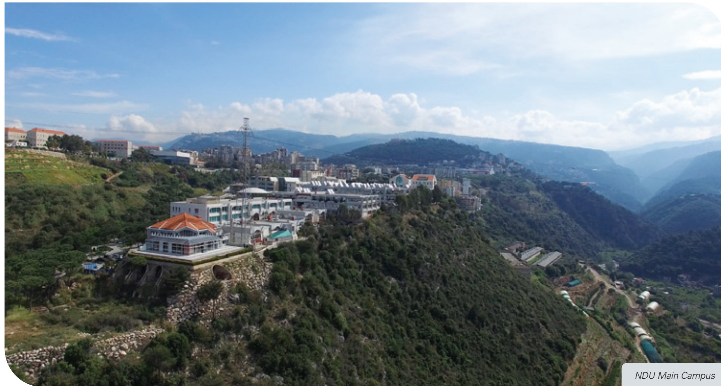
NDU Main Campus