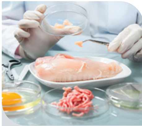
Evaluating and improving the quality, safety, and shelf-life of food products from farm to fork.