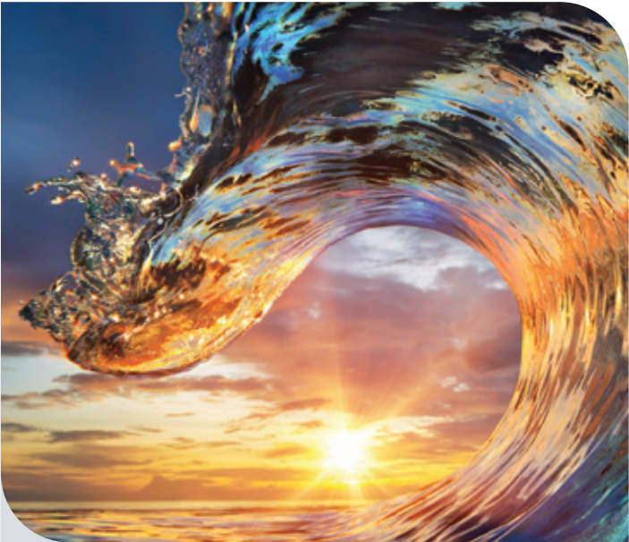
Harvesting the energy in waves through increasing the efficiency of NDU-built compact wave energy converters.