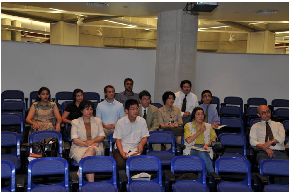
A view of the audience in rapt attention (Aug 2009).