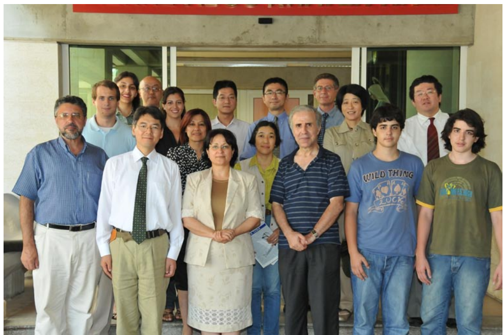
End of Day 1: The group in attendance (Aug 2009).

Tuesday 18<sup>th</sup> August 2009 (Day 2)