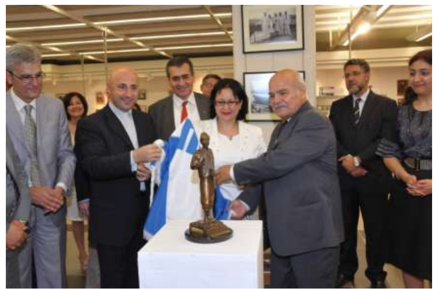
Unveiling the Lebanese migrant statue at the Lebanon and Migration Museum at NDU (Aug 2010).

Then the attendees moved to unveil a miniature replica of the Lebanese migrant statue which commemorates and symbolizes the Lebanese migration. The original life-size statue was unveiled at the entrance of the Port of Beirut in November 2003; at Vera Cruz, Mexico, December 2007; in Chihuahua, Mexico, November 2009, in Brisbane, Australia, February 2010, and in Montreal, Canada, June 2010.