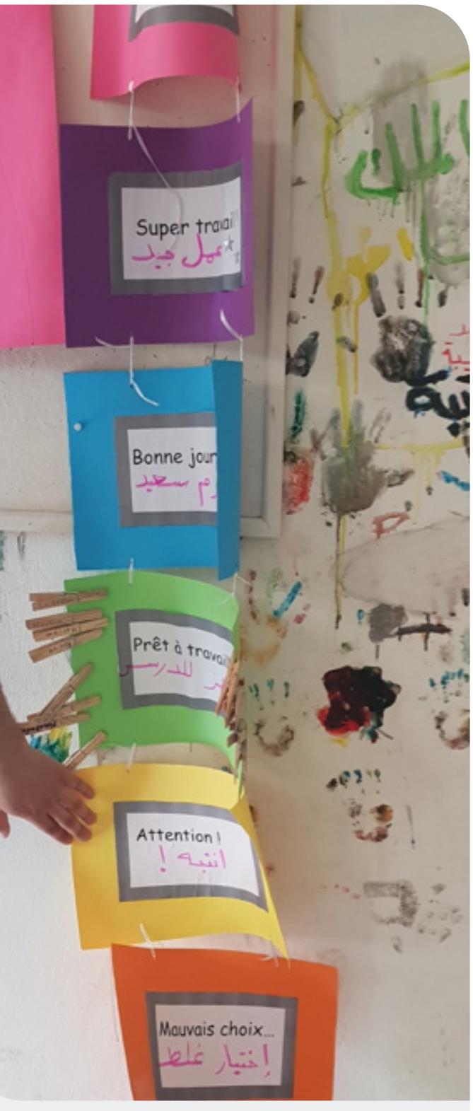
Figure 2. Behaviour modofication colour chart at RR.

We observed structured and ad hoc approaches to managing children's behaviour that can be disruptive or concerning. At RR, an afternoon camp school in North Lebanon, the teachers had created a vertical behaviour chart of seven levels, from "Amiable" (Super) to "Rentre á la maison" (Return home) (see Figure 2). The children's names were written on clothes pins and clipped to a colored message. I observed a child who, apparently out of excitement, pushed another during a dance activity. One of the teachers walked the child out of the class and they stood in front of the chart. The teacher asked the child open-ended questions about why they had pushed and informed them about the