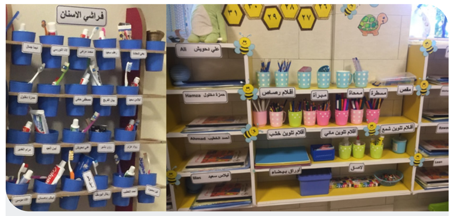
Figure 1. Images of a preschool classroom at BAA. The image on the left is of cupholders with children's toothbrushes and toothpastes. The image on the right shows how all items are labelled, demonstrating a print-rich environment.

JSR is run by Jusoor, an NGO established in the USA and targets Syrian refugee children and families. The school is surrounded by a number of Syrian refugee camps in the Bekaa valley. It is probably the only opportunity for children in many areas in Lebanon to access some form of schooling. However, the physical structure of the building seems quite worn. The school does not have a playground and the classrooms appear to be quite small for the number of students registered and built from poor quality wood. The furniture, like tables and chairs, do not seem comfortable, although the classrooms are very clean. JSR teaches the Lebanese curriculum in order to prepare the children for public schools. The morning shift is from 08:00 to 11:45 and the afternoon shift is from 11:45 to 15:00. Each shift is four class periods with a 20-minute break to eat the food they bring with them from home. They also have a program that encourages young Syrian children to remember their country and preserve their sense of belonging and identity to Syria. During the summer, JSR provides a play program where the children come only to play. This year, they launched a new program, SALAM, for children who are struggling with mental health issues or exhibiting aggressive behaviours.