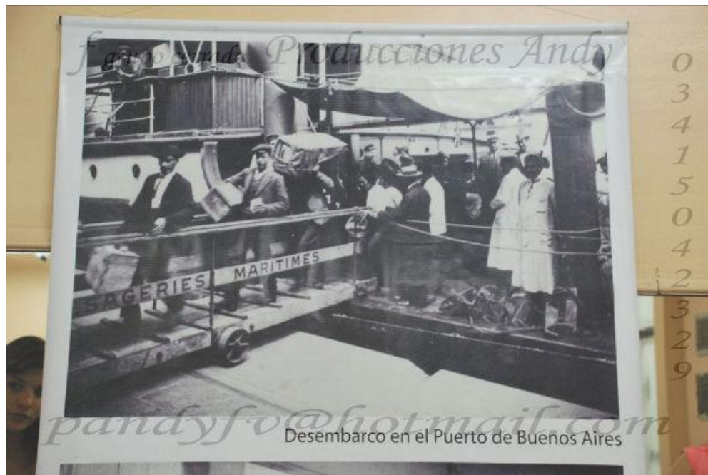
Disembarkation of the passengers at the Port of Buenos Aires. Part of "The path of the Lebanese Immigrant" exposition in Rosario, Argentina. April, 2012.

The Lebanese community in Argentina has been remembering the Lebanese Immigrant Day for eight years. Each year the celebration includes cultural, educational and artistic activities. This time the festivity was accompanied by two exhibitions, one from the National Immigration Museum and another one called The Path of the Lebanese Immigrant , in which pictures of the diaspora were shown with the aim of recalling the struggles the first Lebanese went through.