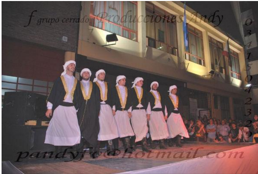
Traditional Lebanese dabke troupe, Firqat Al Azr performing at the Lebanese Immigrant Day in Rosario, Argentina. April, 2012.

The Celebration of the Lebanese Immigrant Day in Rosario, Argentina reportedly had more than 300 attendants. Once the Celebration was formally inaugurated, the Lebanese community enjoyed a night filled with Lebanese flavor. The singer Sumaia Daher performed as well as the folkloric dancing groups Firqat al Azr, Sufar Lubnan and Nuyun Al Shark.