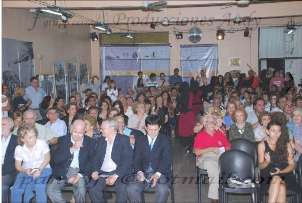
The audience gathered at the inauguration of the Lebanese Immigrant Day in Rosario, Argentina. April, 2012.

After the audience had been entertained with typical Lebanese dances and the video Through the streets of Beirut the inauguration ended with the reading of the Lebanese Immigrant Manifesto 2012 . In this, the Lebanese community of Rosario acknowledged their commitment with peace and the full integration of the immigrants.