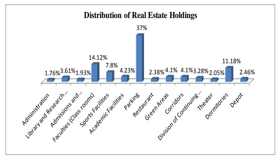
Today, NDU takes pride in its three campuses which have become an essential part of its identity and which differentiate it from its peer institutions in Lebanon.