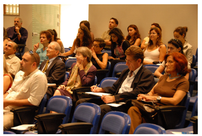
Group of audience

Answering to questions that followed, Dr. Walecki stressed the importance of continued migrant contribution and political participation, the size of contributions, preferably made through individuals, autonomy and accountability, the elimination of secret funding and the implantation of a clear and transparent system to help fight political corruption in the 21st century.