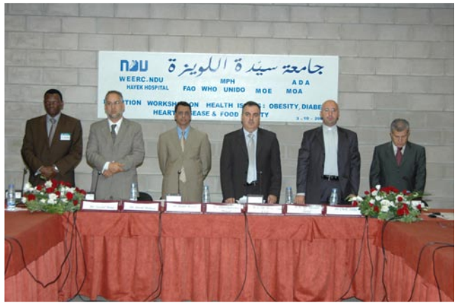
Group of participants in the conference

Another recommendation focused on the need for Lebanese National Clinical Practice Guidelines that include recommendations based on published research that serve as a starting point for health care professionals as they propose treatment for the Lebanese with non-communicable diseases. National Clinical Practice Guidelines would need to have input from all stakeholders including the dietitians of Lebanon and to provide the basis for a collaborative environment between physicians, nurses and dietitians.