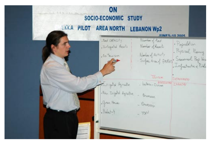
The lecturer at the Workshop

The third workshop process, held in the morning of Friday, dealt with implications of water use, trade-off and conflicts, to define a Business as usual Scenario and then the boundary condition for extreme scenario.